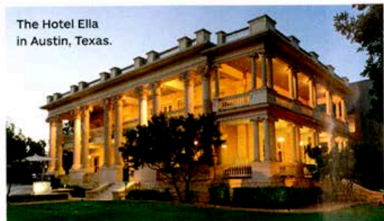
The Hotel Ella in Austin, Texas.