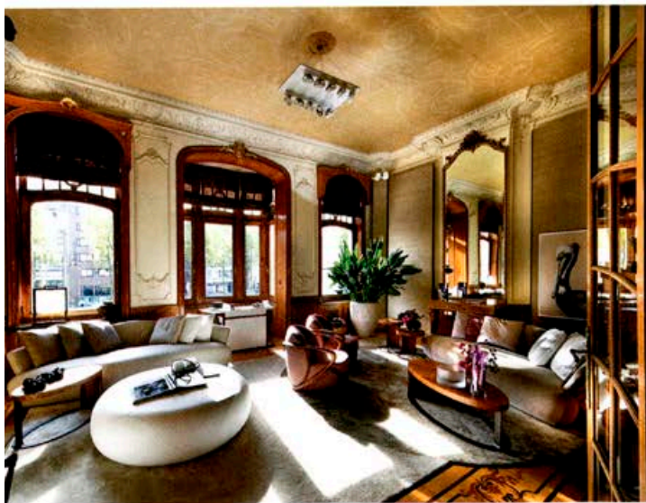
A living area at the Giorgetti Atelier showroom in Antwerp, Belgium.

and a marble staircase—is home to the company's first multilevel Atelier showroom, a concept inspired by the craftsmanship and attention to detail of haute couture fashion houses. Giorgetti's chic pieces are displayed in context across eight rooms, with streamlined seating in the living areas, a minimalist bed and finely crafted dressers in a bedroom, and sleek wood cabinetry in the kitchen. giorgetti-spa.it —ALYSSA BIRD