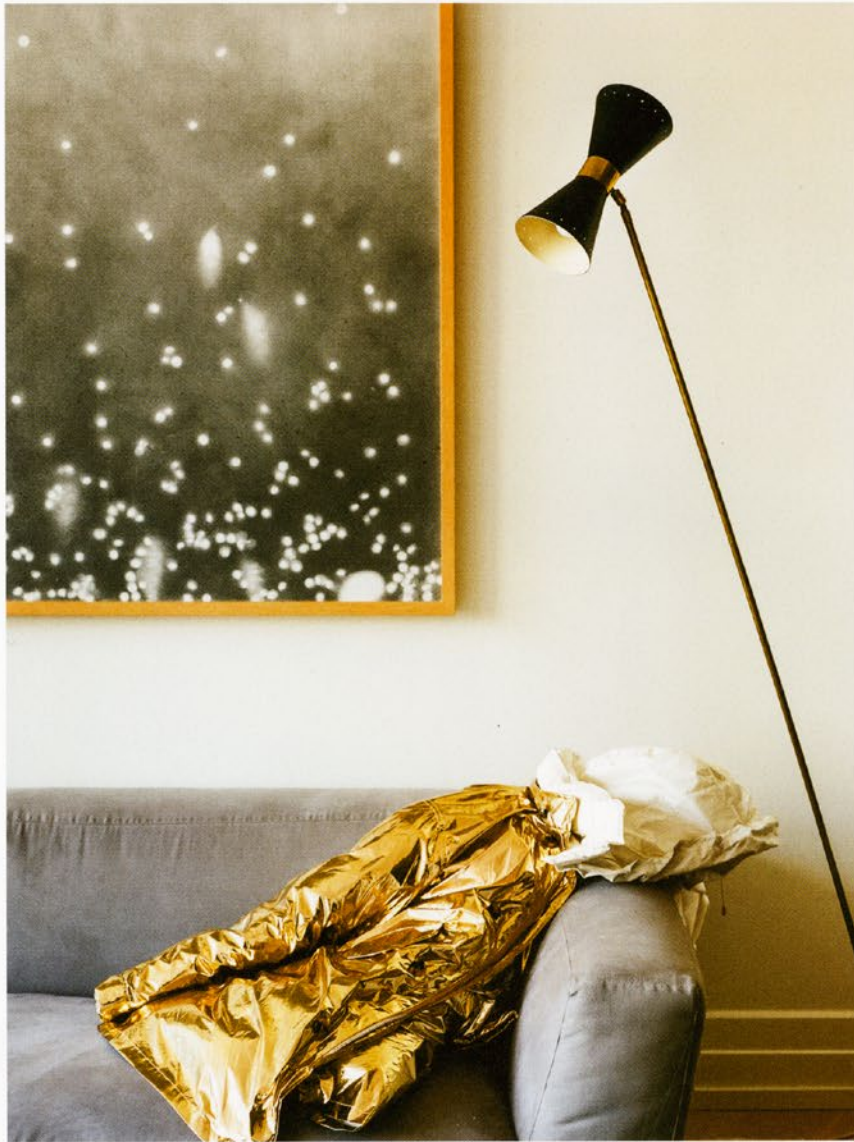
Gold foil laminated PARKA, Calvin Klein Collection.