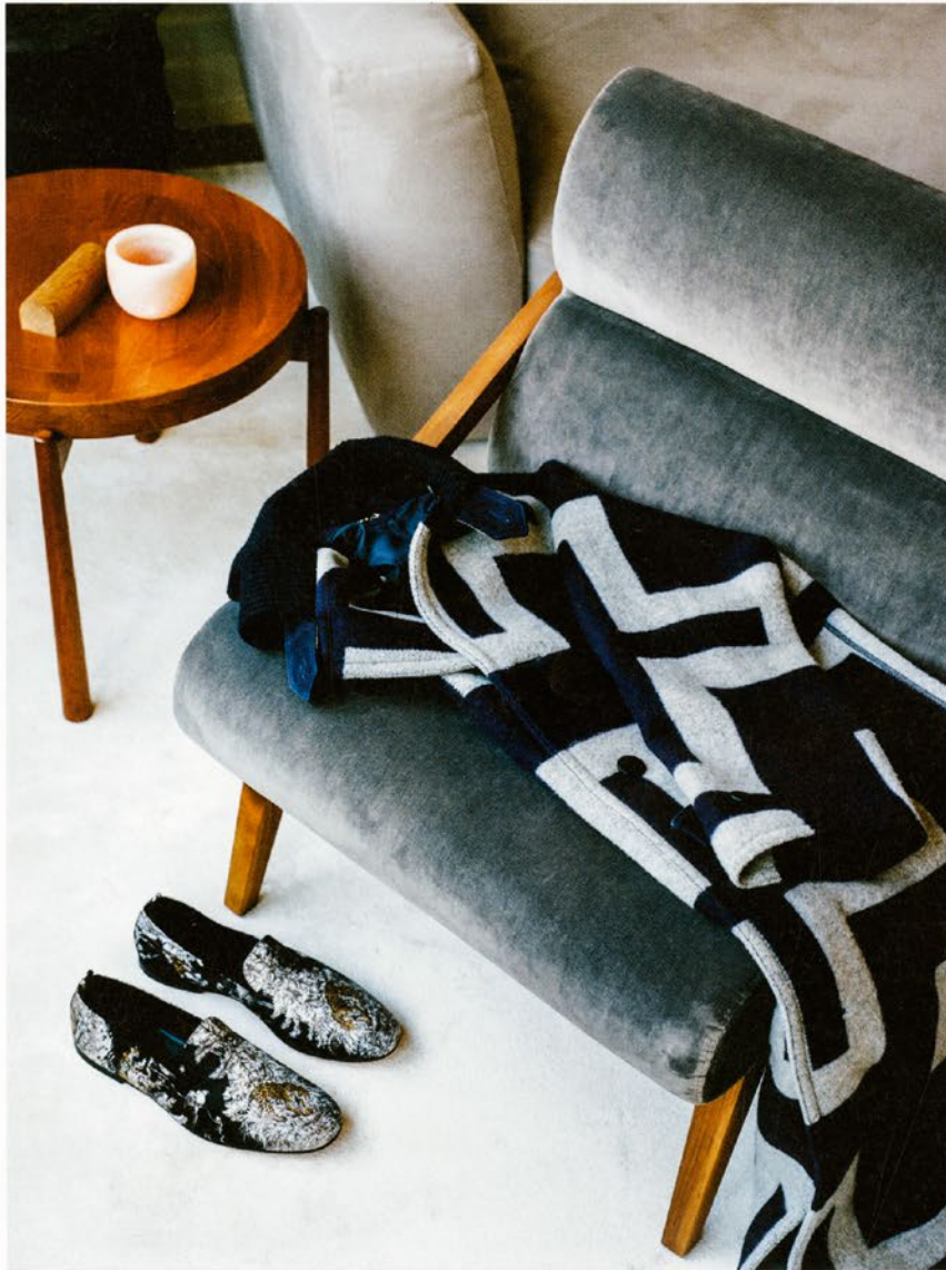
Printed silk LOAFERS, Hermès. Wool COAT, Louis Vuitton.