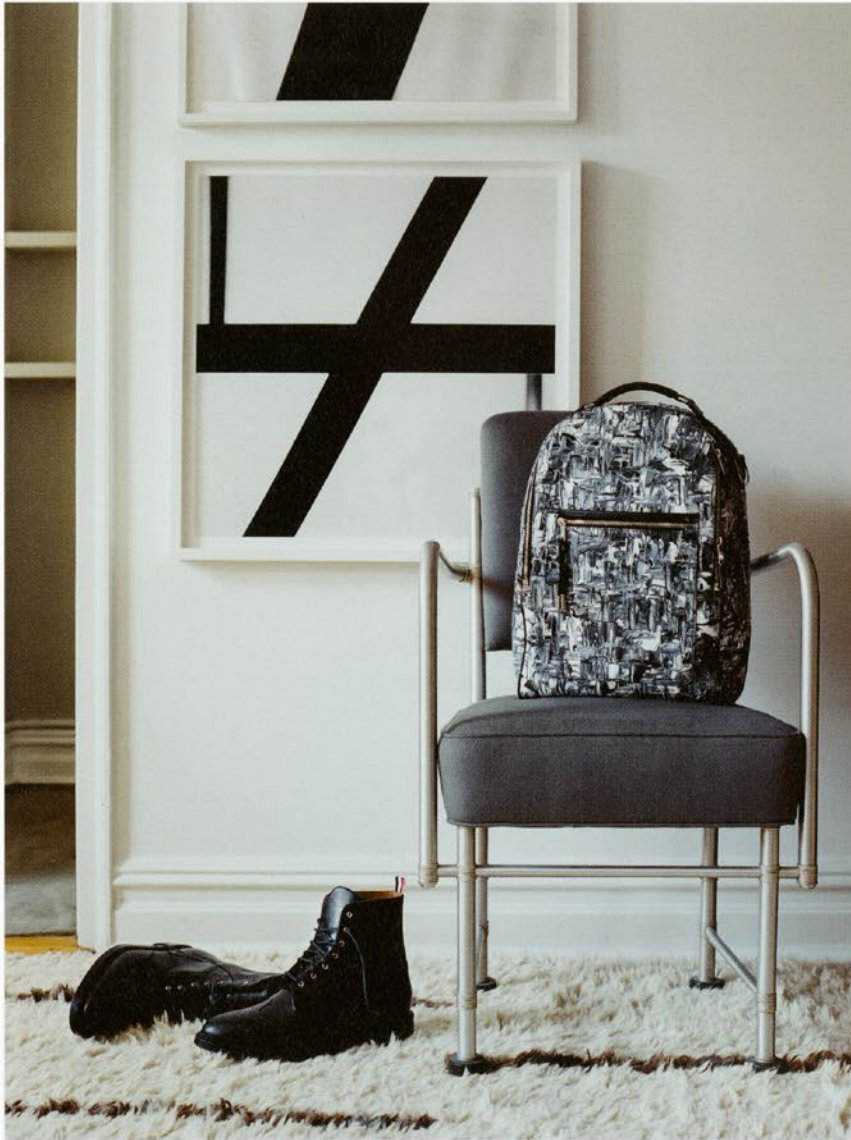
Leather BOOTS, Thom Browne. Hand painted denim BACKPACK, Dior Homme.