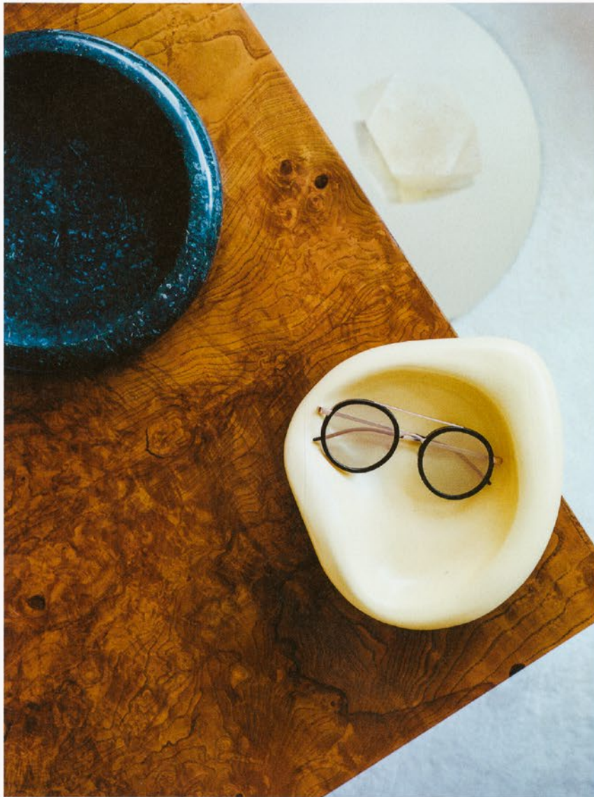
GLASSES, Emporio Armani .