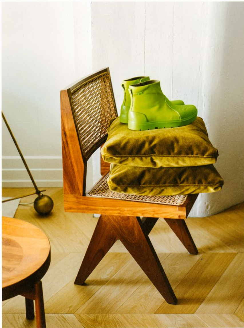
Left, Leather BAG, Hugo Boss . Top, BOOTS "Vintar" in lime, Camper .