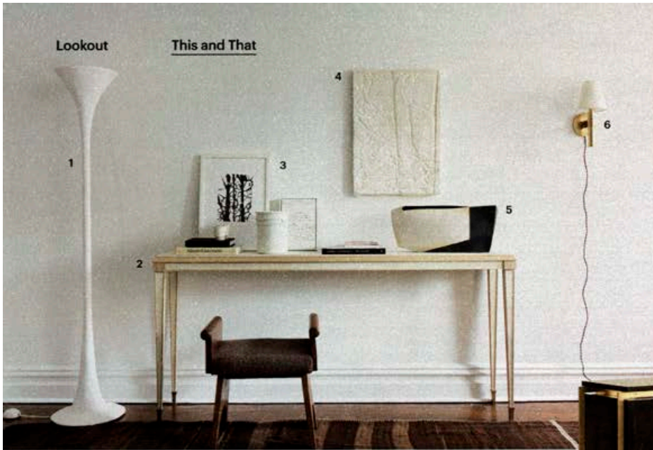
A CLEAN, WELL-LIGHTED PLACE (1) Kacper Dolatowski's plaster torchiere lamp, $5,500. (2) Billy Cotton's parchment console, $18,800. (3) Matthias Merkel Hess's glazed ceramic "White Bucket, Small," $600. (4) Jed Ochmanek's concrete artwork, $2,100. (5) Maren Kloppmann's black-and-white porcelain vessel, $4,200. (6) Robert Stiller's brass sconce, $3,000. (7) Cotton's Elements table, $38,800, and (8) Cotton's Antwerp cabinet, $28,000, exclusively through Ferrer.